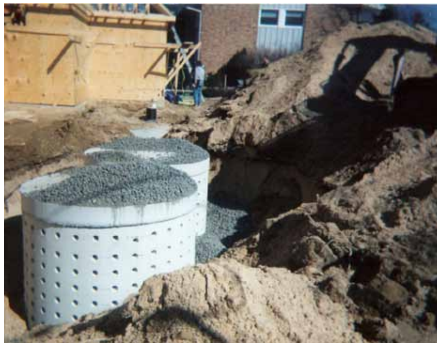
Prefabricated concrete drywell chambers.

Inlet and outlet pipe installation can be done by the same means used to connect pipes to standard manholes. Surface backfill construction should follow project specifications.