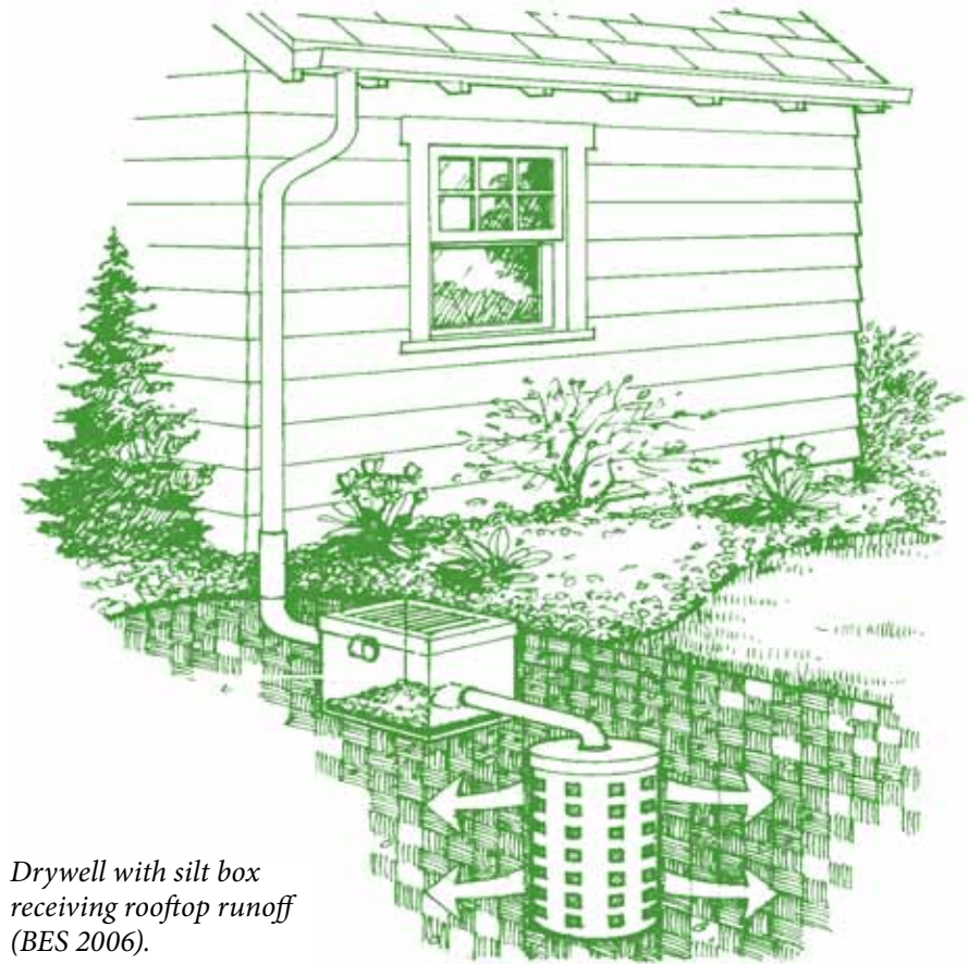
Drywell with silt box receiving rooftop runoff (BES 2006).

In Oregon, there are generally two kinds of drywells that are commercially available, both of which are perforated manhole rings. In other areas of the country, the information available suggests designs that don't use a prefabricated chamber at all, but instead fill the entire vertical excavation with storage aggregate