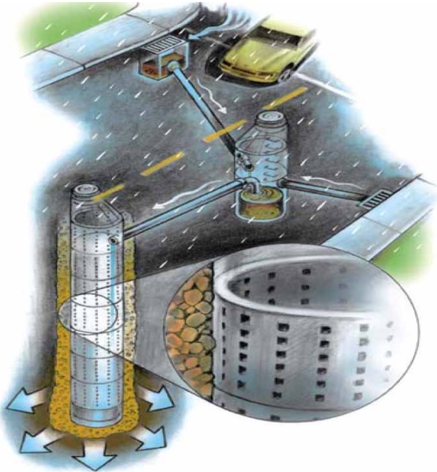
Drywells in a public right-of-way setting with pretreatment sediment manhole.

A common guideline to determine an appropriate setback distance for infiltration facilities in general is to assume that water moves equally horizontally as it does vertically (in other words, that it moves in a 1H:1V ratio). An appropriate setback can be calculated by ensuring that saturated zone of soil is outside the structural components of the building (see figure on previous page). Consult the state building codes and a geotechnical engineer to confirm how close your infiltration facilities can be located to critical infrastructure.