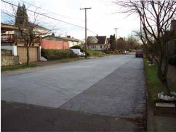
Impervious concrete installed next to pervious concrete on N. Gay Street (a public road) in Portland, Oregon.

during the dry season when material can be blown. The cleaning interval, which might range from every 6 months to 3 years, should be based on possible exposure to sediments.