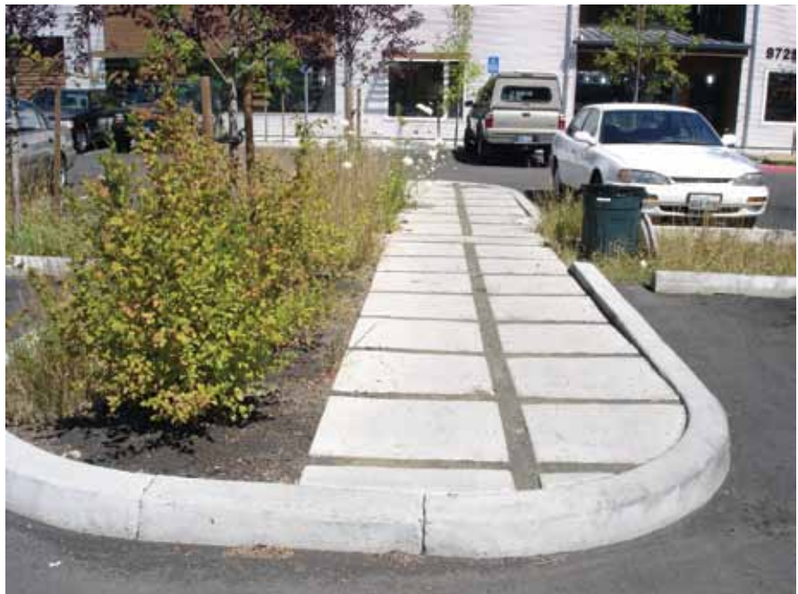
Poured-in-place, impervious-concrete permeable pavers at the Broadway Cab Company in Portland, Oregon.

Unclogging a clogged paver installation is relatively easy. Simply vacuum up the No. 8 rock in between the pavers and then replace it. For sustainability and cost reasons, you may also consider vacuuming the rock, washing it off, and replacing it. Take erosion control measures if you decide to wash it.