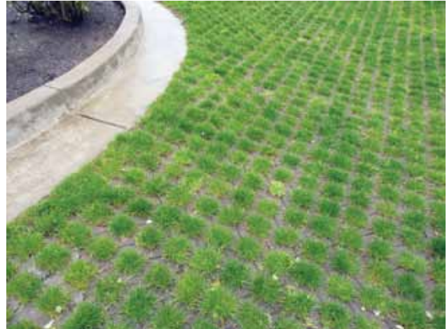
Concrete grass pavers were used in the Willamette Park overflow parking to grow grass and preserve site permeability in this low-traffic area.

required if ground disturbance is large enough.