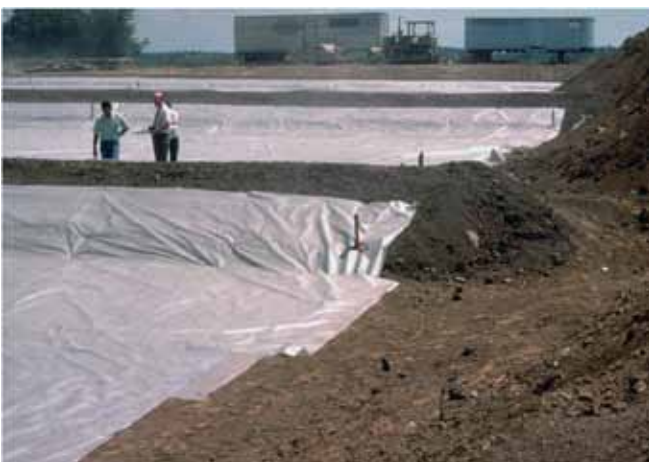
Overlapping the geotextile.