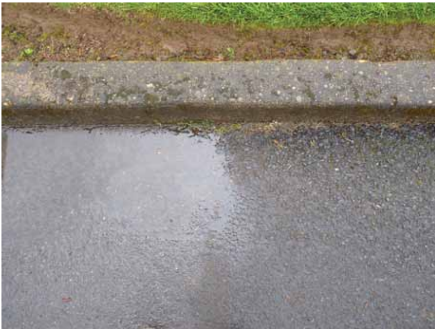
Porous asphalt pavement next to impervious pavement.