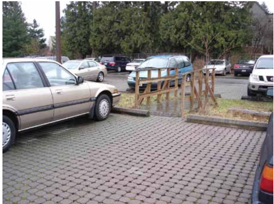
Permeable pavers at the Multnomah Arts Center, Portland, Oregon.

Permeable pavements are generally sized to infiltrate a 2-year, 24-hour storm event. However, they should be able to pass a 100-year, 24-hour storm, which requires the construction of overflow or control structures to ensure that the pavement does not saturate and potentially destabilize. Porous pavements are designed to infiltrate rainfall falling directly onto the surface. Most porous pavements do this by storing stormwater in the voids of a uniformly sized (that is, all the same size) base rock below the pavement surface. Additional storage in the system can be achieved by increasing the depth of the rock base; infiltration of a larger storm such as the 25-year, 24-hour design used to mitigate downstream flooding can be achieved easily in soils with infiltration rates as low as 0.1 inches/